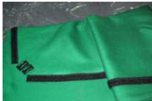
Velcro on cloths